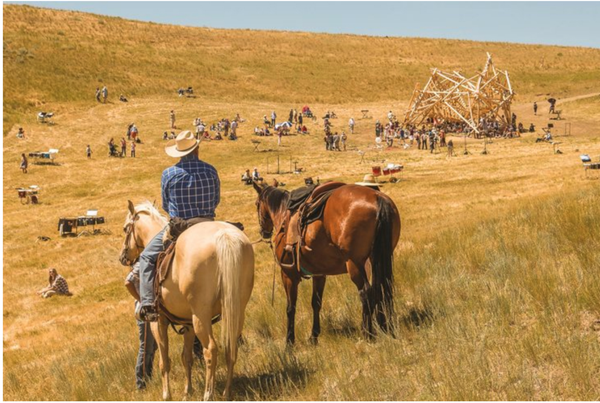
THE PROJECT "SATELLITE # 5: PIONEER" DOES NOT ONLY LOOK IMPRESSIVE IN ICY SNOWY LANDSCAPES.

In the interface between architecture and art, the current exhibition " unearthed " by New York artist Stephen Talasnik can also be classified. Two organic sculptures made of woven bamboo strips define the exhibition area. As a rule, Talasnik builds his sculptures in the landscape outside. For unearthed he applies his methods for the first time in the interior. Nevertheless, all the sculptural works - whether outside or inside - have one thing in common: they are site-specific.