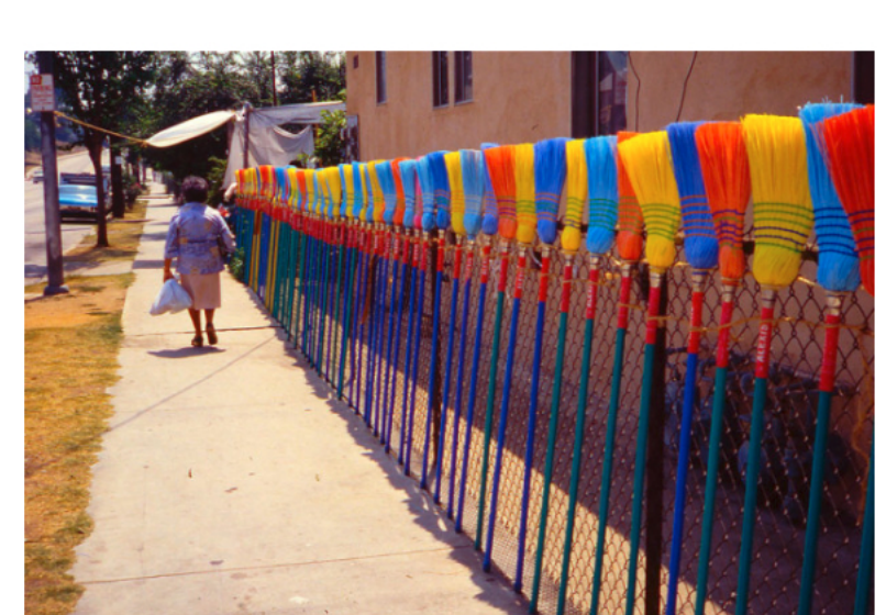
Is Los Angeles discovering public space?