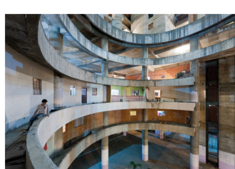
What does the evacuation of the Torre de David mean?