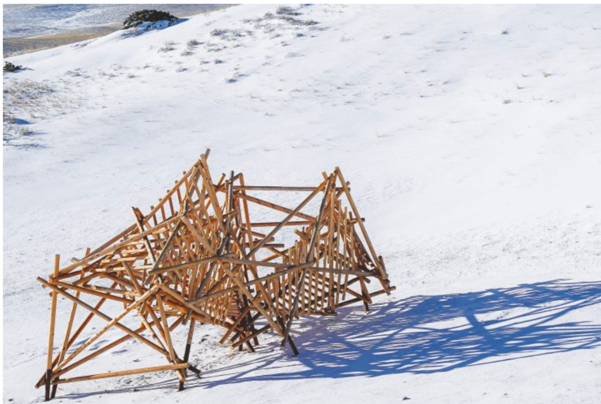
THE SATELLITE # 5: PIONEER PROJECT IS ONE OF TALASNIK'S LARGE-SCALE PROJECTS.