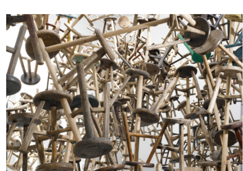
Wood - an urban material?